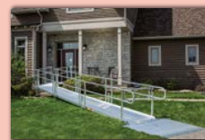
Indoor & Out door Ramps