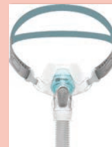
CPAP & Oxygen Supplies

Accepting Medicare, MediCal and other insurances